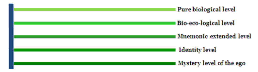
Figure 3. Schematic representation of the ordinary levels of consciousness

inauthentic manipulation of death, which should not be understood in terms of suicide or expectation, but in terms of our most authentic possibility, that is "being for death": M. Heidegger's Sein und Zeit (1927, en. Tr. Essere e Tempo, Utet, Torino 1978). This may constitute a kind of deliberate anticipation of death, a sort of pre-suicidal form: it would seem to constitute the suicidal idea that connects bipolar and unipolar subjects, albeit in very particular form, the sign of the universal recognition of the tragic nature of existence "here and now" that connects the consciousness in all its levels (Figure 3) (Cocchi et al. 2012c) and if all the expressions (solidaristic empathy, where empathy, however, is not so much a simple evolutionary trait, but a complex experience of several levels (Boella 2006; Boella 2009).