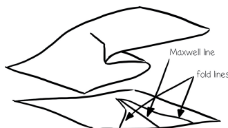
Figure 2.1: Cusp catastrophe

The natural expectation is that the number of critical deformations is infinite and corresponds to conformal symmetries naturally assignable to criticality. Conformal symmetry would be naturally associated with the super-symplectic algebra of \delta M_{\pm}^4 for which the light-like radial coordinate plays the role of complex coordinate z for ordinary 2-D conformal symmetry. At criticality the symplectic subalgebra represented as gauge symmetries would change to its isomorphic subalgebra or which versa and having conformal weights are multiples of integer n . One would have fractal hierarchies of sub-algebras characterized by integers n_{i+1} = \prod_{k < i+1} m_k .